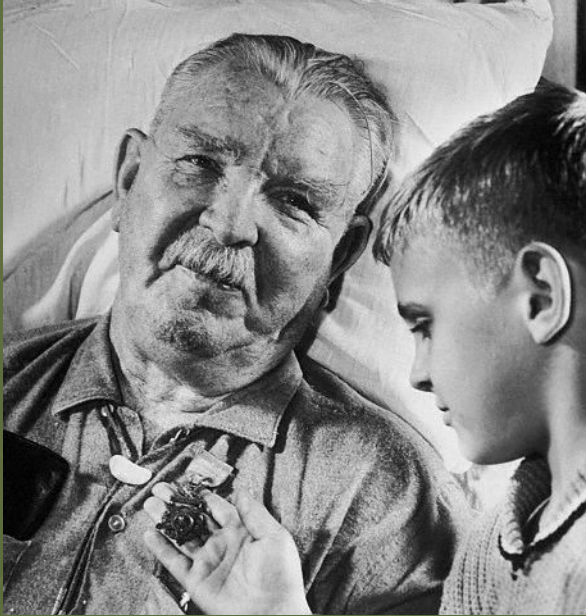
Alvin C. York & grandchild