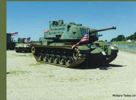
M247 Sergeant York