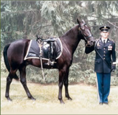
Sgt. York U.S. Army