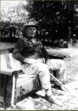
Sgt. York 1953