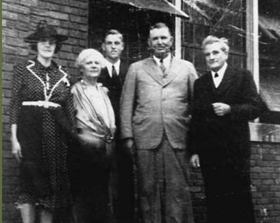
Alvin York, Gracie, son George, & the Standleys