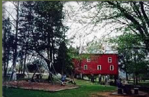
York Historical Park, Pall Mall, TN