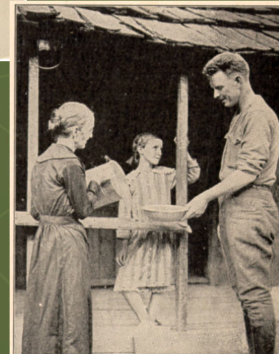
Home, Sweet Home Back home again in the Tennessee mountains.