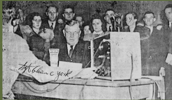
7 December 1941