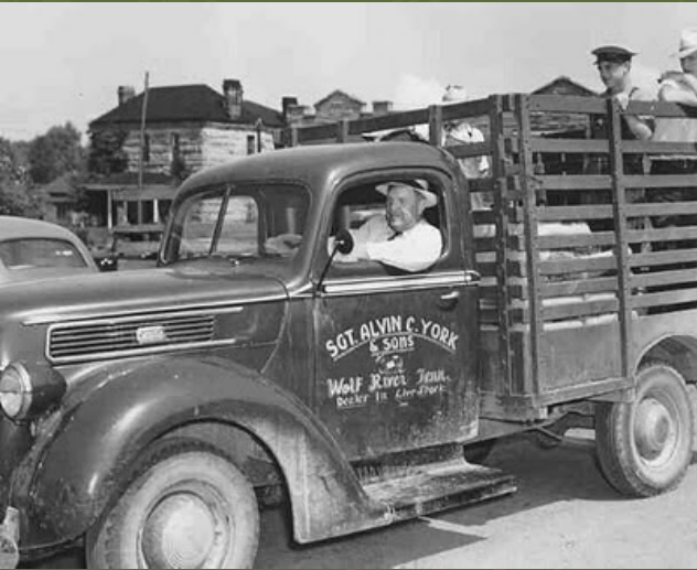
Alvin York, 1950s