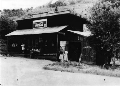
York & Sons Store