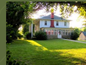
York Home & Wolf River Church